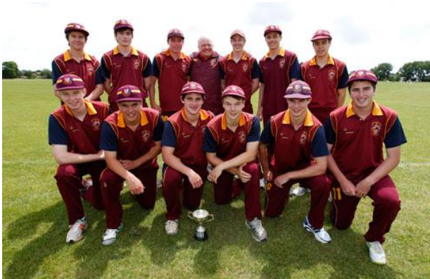
The victorious King's College team